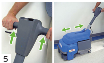
5 Pull triggers. Clean floors.