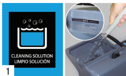
1 Fill solution tank with floor cleaner.