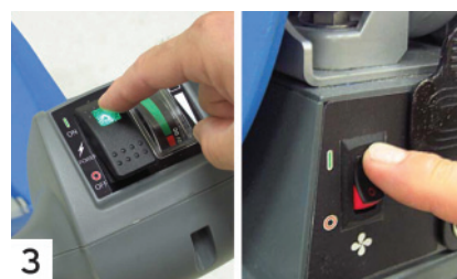
3 Turn power on.