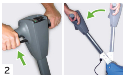
2 Lower handles.