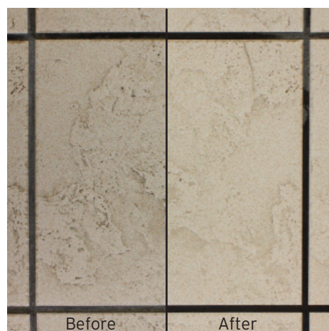
One pass with Scrub N Go