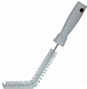
Item # 92212765