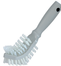
Item # 92212764