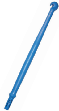
Item # 92212761