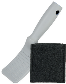
Pad Holder- Item # 92212762 Pads- Item # 92212743