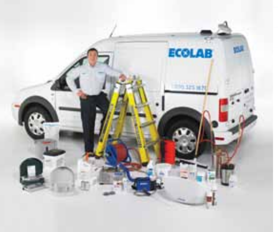
Your Ecolab Service Specialist is fully equipped and ready to address all pests, every visit.