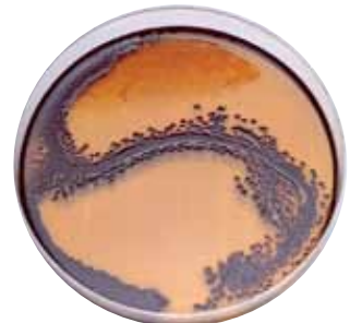
E. coli mechanically transferred by the cockroach