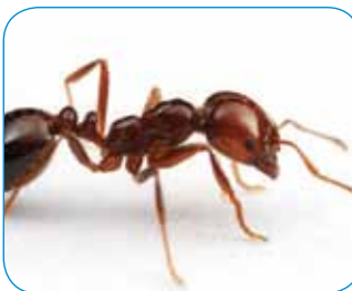
The fire ant can bite or sting patients

ANTS are associated with unsanitary environments and certain species can bite or sting patients.