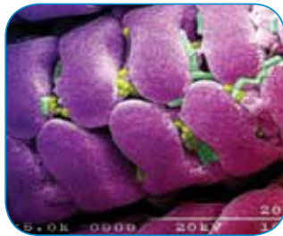
Magnification of fly mouth – yellow and green bacteria is E. coli