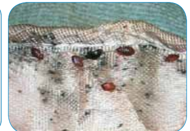
Mattress seam with bed bugs and their fecal matter