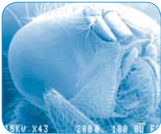
Magnified head of fly – body hair can pick up and transfer disease organisms

HOUSE FLIES are known to harbor over 100 pathogens with the potential to transmit these disease organisms anywhere they land.