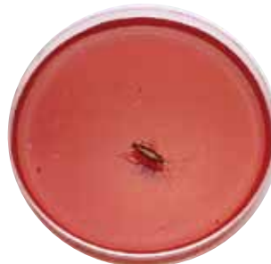
German cockroach in a petri dish

COCKROACHES carry disease-causing organisms and can cause serious allergic reactions in patients.