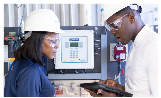
Leverage the expertise of Ecolab to guide your organization at the time of onboarding and whenever questions arise.