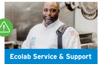
Ecolab Service & Support