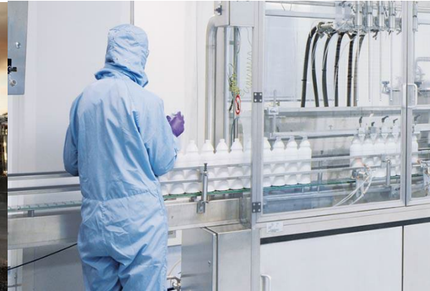
GLOBAL LIFE SCIENCES