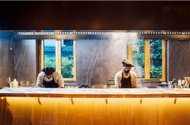
GLOBAL INSTITUTIONAL & SPECIALTY