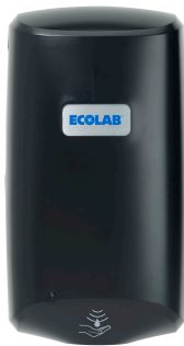
Classic and Compact Touch-Free Dispensers