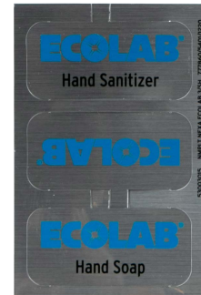
Product Category Badges

TO LEARN MORE CALL 800.352.5326 OR VISIT ECOLAB.COM