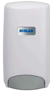
Classic and Compact Manual Dispensers