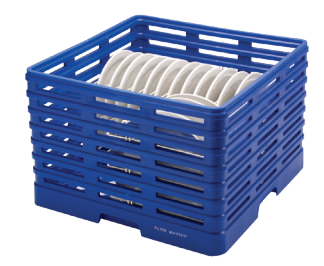
Plate Master Racks™