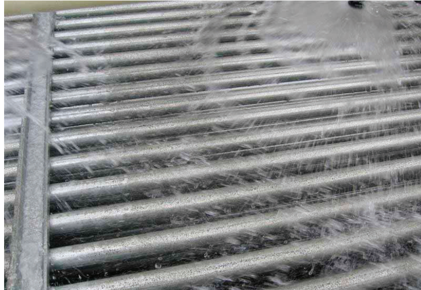
Visual indication of metal passivation

Industry has tried to mitigate white rust corrosion but results have fallen short of expectations. Given the increasing focus on sustainability, a solution to this problem must be found.