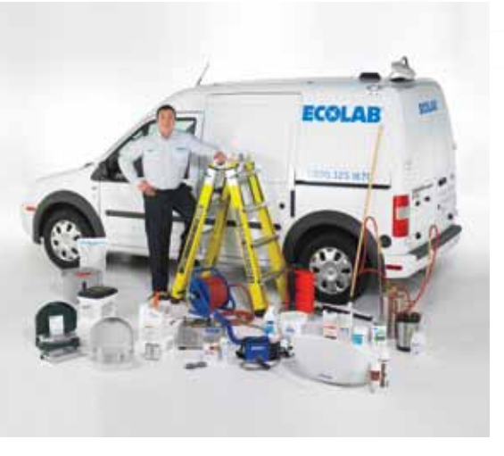
Your Ecolab Service Specialist is fully equipped and ready to address all pests, every visit.