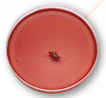
German cockroach on petri dish

Cockroaches present a significant risk to food safety due to their ability to vector and spread E.coli, Salmonella and dysentery. They contaminate food and food-handling surfaces via their droppings or mechanical transfer from their bodies.