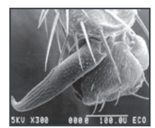
Cockroach tarsus (foot) magnified 300 times