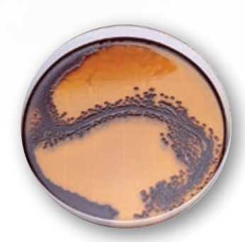
E. coli mechanically transferred