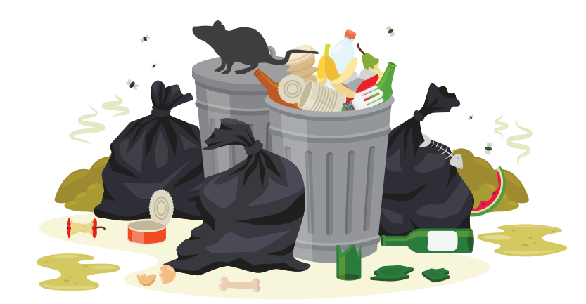
Sanitation issues are major contributors to infestations in facilities and act as breeding sites for certain pests

They hide and breed in tiny cracks and crevices you may not even be aware of